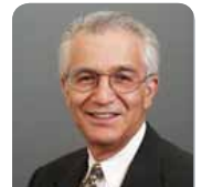
Foad NAHAI Plastic Surgeon USA