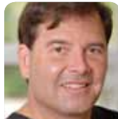
Constantino MENDIETA Plastic Surgeon USA

5 PM ..... 20min THE XYZ INTRAMUSCULAR METHOD (VIDEO) Raul GONZALEZ Lecture 1121