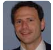
Olivier GERBAULT Plastic Surgeon France

5 PM ..... 75min INTRODUCTION - FOCUSED QUESTIONS WILL BE ASKED TO EACH OF THE PANNELISTS ON: • MANAGEMENT OF THE DORSUM • CHOICE OF OSTEOTOMIES • SEQUENCE OF TIP SUTURES • USE OF SUPPORT GRAFT Olivier GERBAULT Lecture 2310